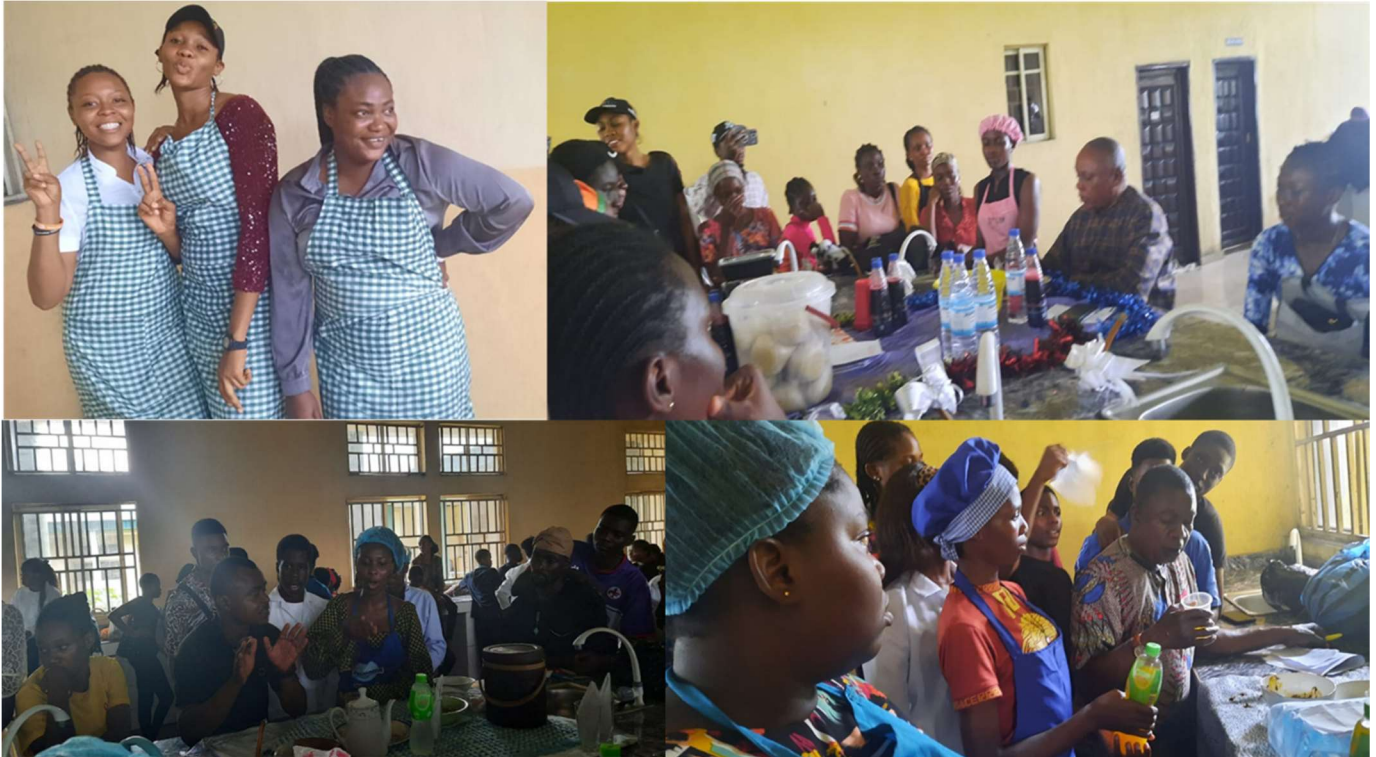
Students and Assessors at the sensory evaluation assessment practical.

September 26 th , 2024: Year three Home Science students successfully completed the practical aspect of Food Service Systems and Administration (HEM 309.2) On Thursday September 26th, 2024. Students demonstrated competence in preparation of adequate diet and presentation of palatable food and service. Effective teamwork was acquired among others.