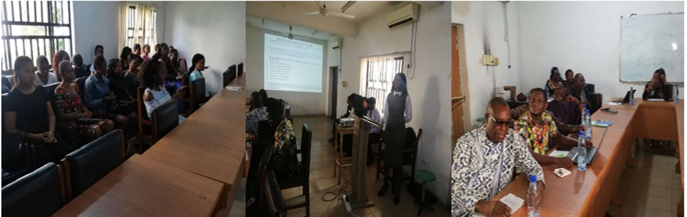
Post-field seminar presentation of undergraduate students.

The post-field seminar presentation for the final year students was held. The presentation afforded the Department opportunity to be intimated with the progress of each student and their readiness for the Project defence. Useful suggestions were made on each presentation to improve the final delivery eventually.