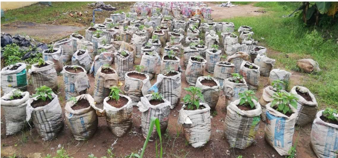
Pepper production in bags

The production of tomato and pepper in soil-filled bags was flagged off on the 23 rd of September, 2024. The pepper seedlings were initially raised in nurseries prior to transplanting in these bags. The production objective is to raise tomato and pepper seedlings in 1000 bags. The bags are currently being raised on the platform for expected greenhouses at the back of the Department. We appreciate participation of Prof J. A. Orluchukwu, Mr P. O. Emobonavie and the SIWES students. It is our hope that the pepper, tomato and other crops' needs of the University of Port Harcourt community will be met by the Department of Crop and Soil Science very soon. The Department appreciate the motivation of the Vice Chancellor, Prof. Owunari A. Georgewill and other management team on the need to improve production.