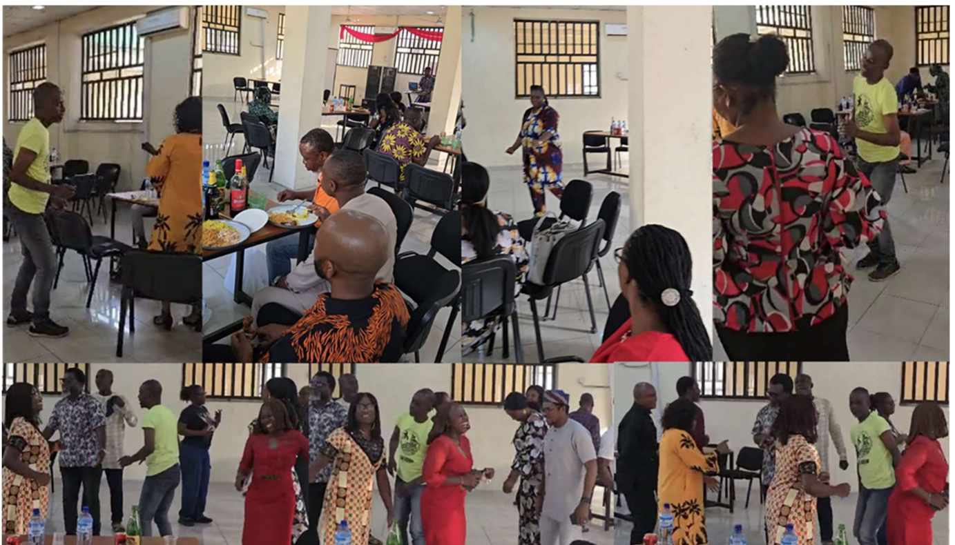
All dancing at Faculty Christmas Party 2024.