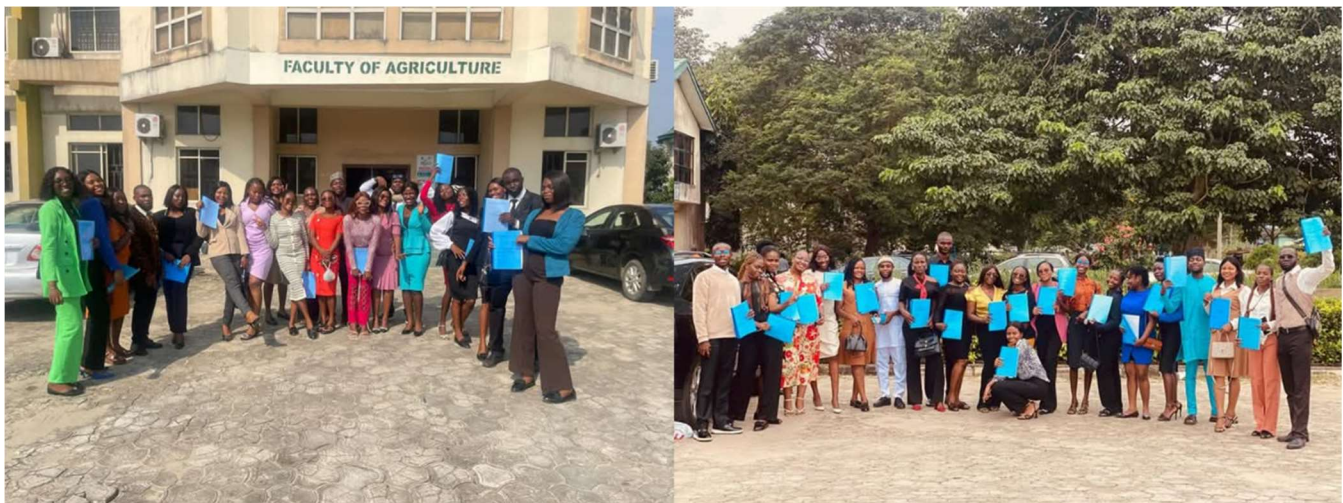
Final year students after their external project defence.