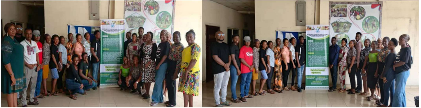
Members of the Agribusiness Club and some academic staff of the Department.

Thrilled by the 2024 final year students class initiatives during their presentation and demonstration of their business ideas of the course Principles of Cooperative Practice. Group 1 presentation was Students Entrepreneur Skill Development Cooperative Society. A group aimed to empower and support youths for successful agribusiness operations. Group 2 developed a business plan on promotion of edible nuts promotion and consumption for a healthy living while group 3 created a business interest in supporting cassava growers and value addition along the value for sustainable food production and security in our community.