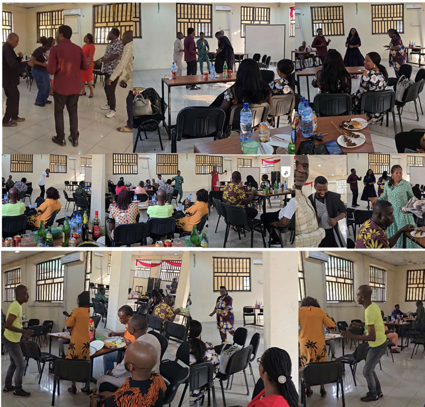
Members of Academic staff having a relaxing time at the Faculty Christmas Party 2024.