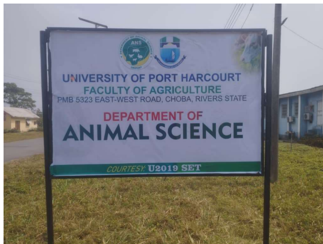
Departmental Billboard donated by U2019 Students' set

In a remarkable display of institutional pride and generosity, the 400 level Animal Science students, donated a modern billboard to the Department. The project was entirely funded through contributions from students in the U2019 set, showcasing their unity and dedication to leaving a positive legacy. The billboard will serve not only as an information hub but also as a testament to their commitment to departmental development.