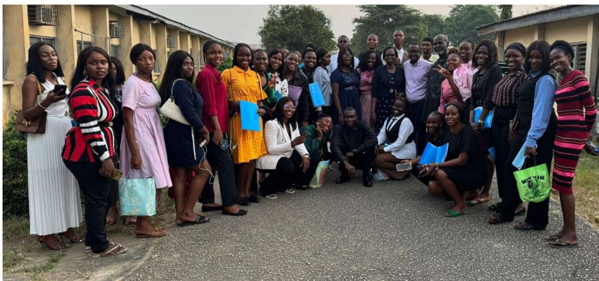
Picture from external project defence.