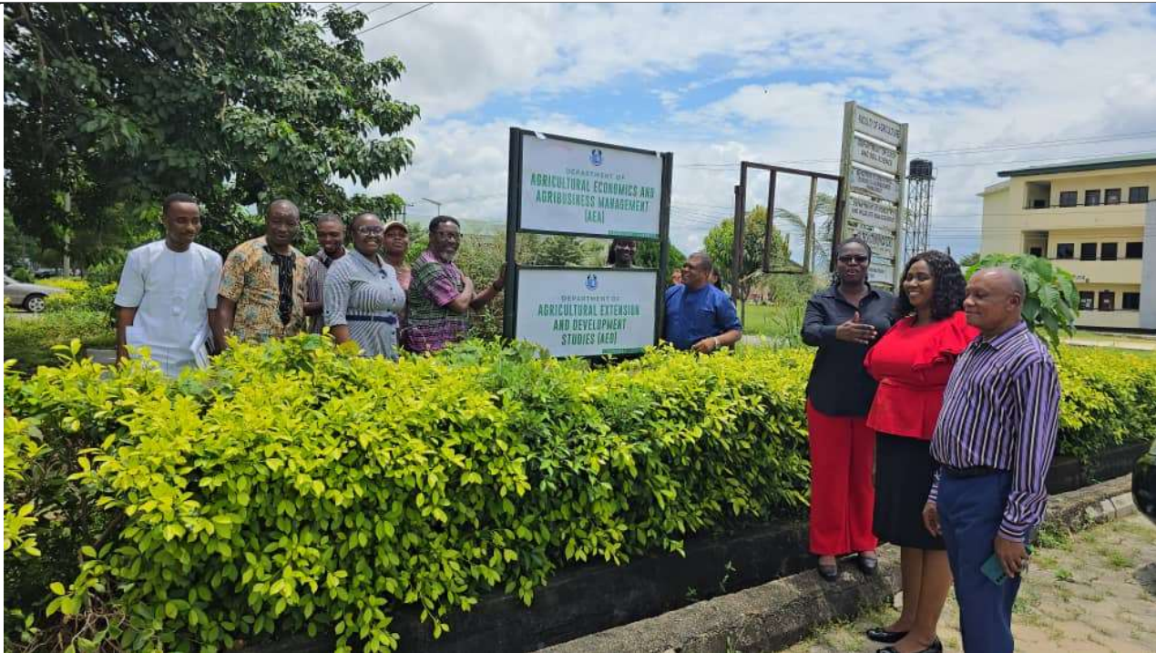
Unveiling of the new signpost by the Dean in the presence of staff and students of both departments.