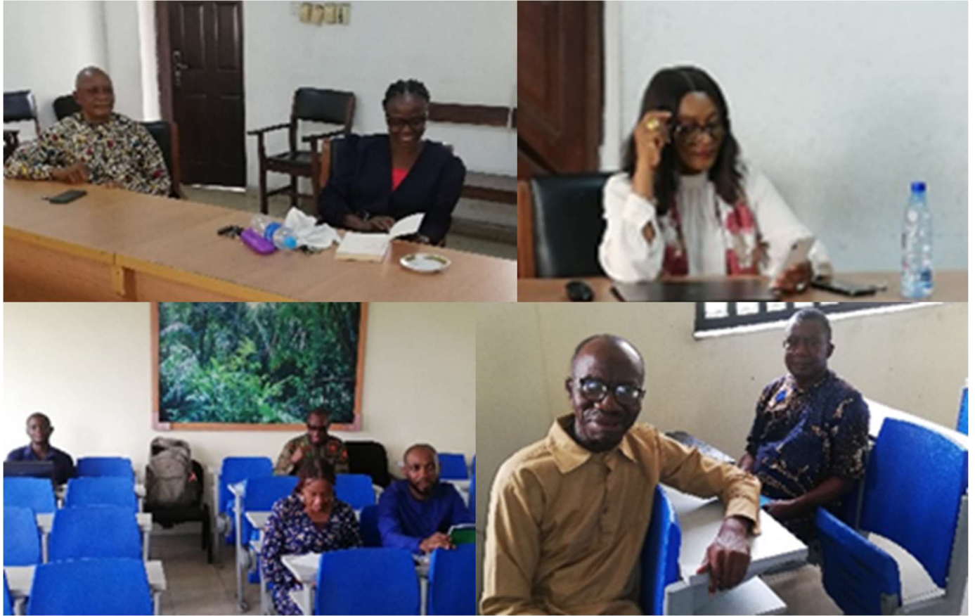
Some members of staff in attendance at the project defence.