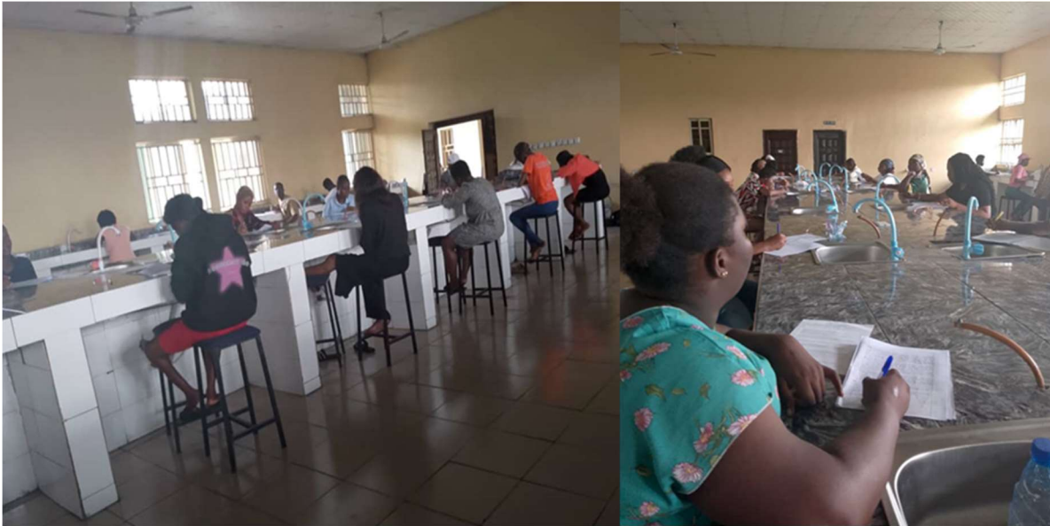
Students at an examination hall.

September 30 th , 2024: Examination commenced for the second semester.