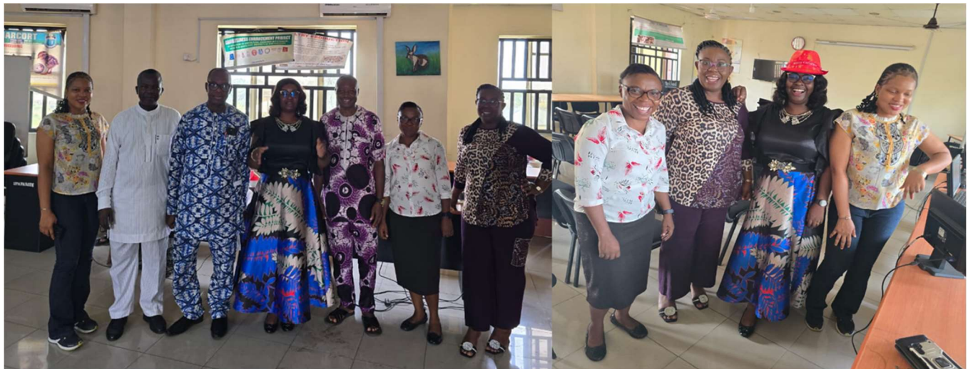
The Acting HoD of AED and Members of Staff at the Department End-of-Year Party 2024.

December 11 th , 2024: The Department of Agricultural Extension and Development Studies held her end-of-year party on the 11 th of December 2024 for all members of the departments, alongside PG students and Course Reps of 200 and 500 level. It was a beautiful year to end a successful year