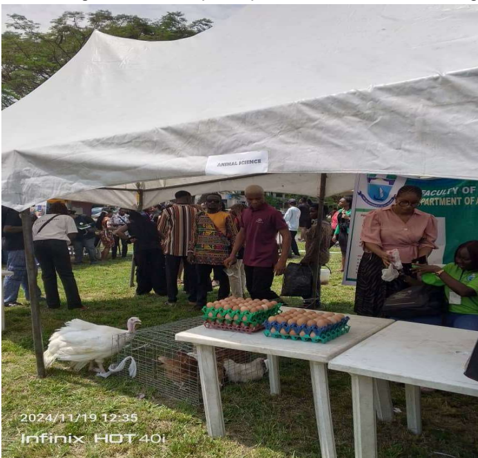
Animal Science exhibition stand during the Agriculture Week 2024.

The Department participated in the Faculty of Agriculture celebration of her annual Agriculture Week. Key highlights of the celebration included but were not limited to, lecture series, delivered by profound stakeholders in the Agricultural profession, exhibition of agricultural products by the different departments in the Faculty and interactive session and networking between the participants of the event, including students.