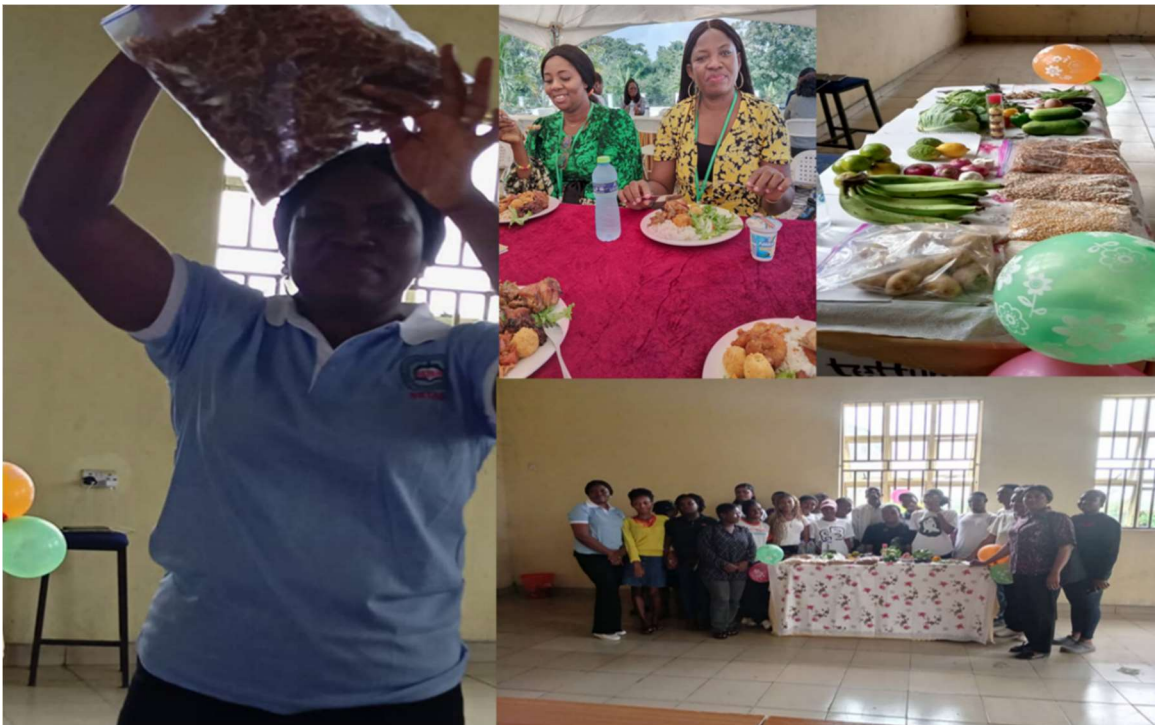
Staff and students of the Department Commemorating World Food Day: Right to healthy food as a fundamental human right.