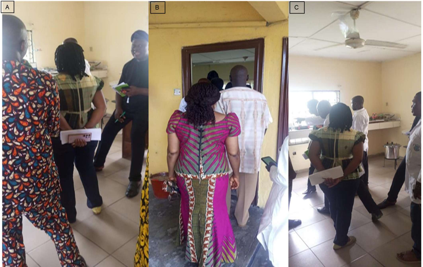
Photo A: Leader of the accreditation team from NUC in conversation with some members of staff Technologist; Photo B: Some members of the team inspecting laboratories in the Fisheries Department, while other lab. technologist is seen demonstrating the workability of some equipment in the Department, with some accreditation team member watching on (Photo C).