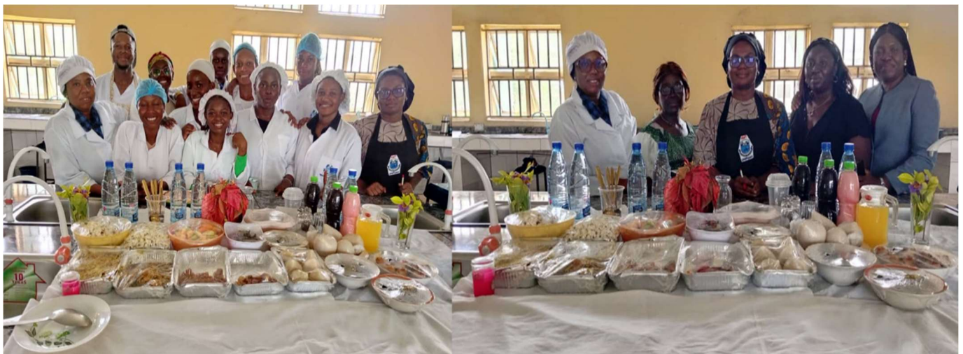
Year three Home Science students and their lecturers in a practical class of Food Service Systems and Administration.

September 26 th , 2024: Year three Home Science students successfully completed the practical aspect of Food Service Systems and Administration (HEM 309.2) On Thursday September 26th, 2024. Students demonstrated competence in preparation of adequate diet and presentation of palatable food and service. Effective teamwork was acquired among others.