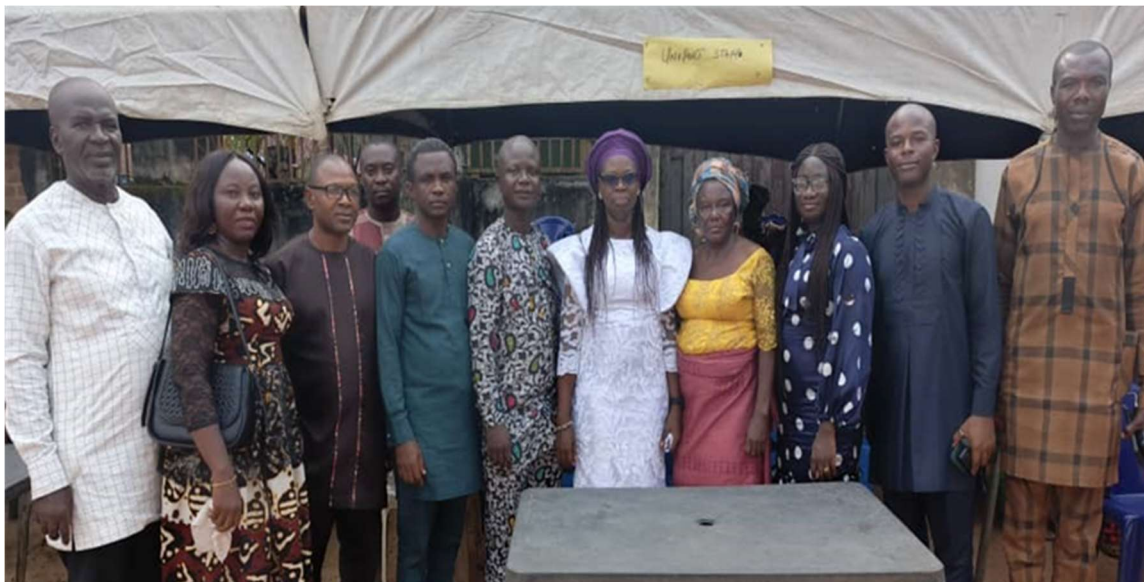
Members of staff in attendance of the HoD's father's burial ceremony.