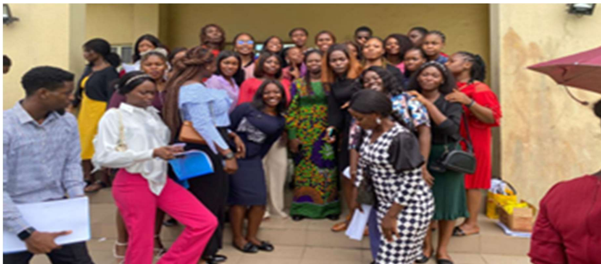
Picture from seminar presentation.