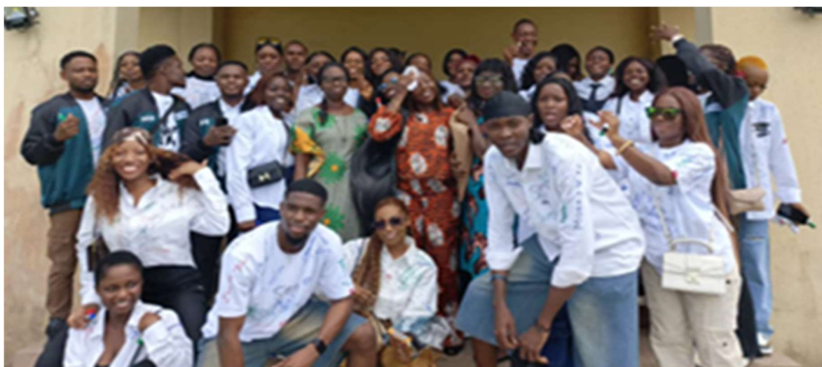
Picture from post-data presentation.